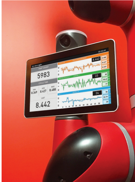
Sawyer with Intera™ Insights